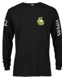
Breast logo Arm designs