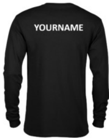
Name on the back

Custom orders are also available. You just need to supply the artwork (good quality). For custom orders, contact me or fill in details below