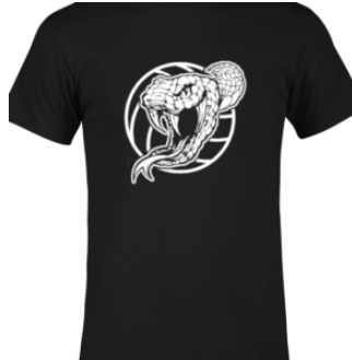
Viper on Ball