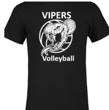
Viper on Ball with letters