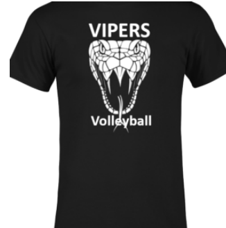
Viper Head with letters